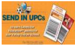
Campbell's Soup Labels

Sun Valley Indian School uses the labels to acquire much needed items, including refrigerators, 15-passenger van, portable wireless PA system, sports equipment, Dell computers, a 7-passenger van — and much more!